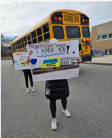
Mashpee Shares Its Appreciation for CCC Drivers and Monitors!

The CCC Transportation team would like to thank the Mashpee and Nantucket school districts for the recognition events they held last quarter in honor of our bus drivers and monitors. Pictured below are Quashnet Intermediate School (Mashpee) students holding decorated signs they created to thank our bus drivers. Nantucket also hosted an appreciation lunch at Nantucket High School and distributed cards to all drivers and monitors in recognition of the wonderful work they do. The Collaborative is grateful for the hard work and dedication of our transportation staff, and we deeply appreciate the school districts for showing their support and appreciation as well